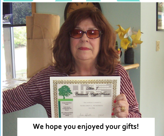
We hope you enjoyed your gifts!