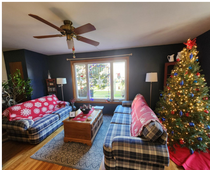
(Holiday Picture Gifted to us from our very own Phil Schmehl)